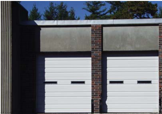
2 tailboard height loading docks on available floor.