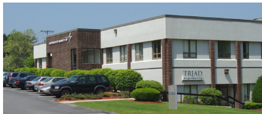
164 Middlesex Tpk, home to AdvizeX