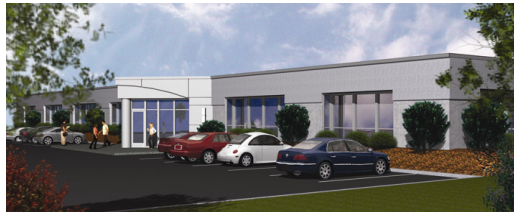
21 North Avenue, home to G4 Technologies

G4 Technologies is a specialist software solutions and products company providing enterprise wide solutions. G4 Technologies has been solving business problems with technology solutions since 2000. G4 utilizes its methodology and best practices in combination with knowledge experts to deliver complex, high-performing systems for leading customers in finance, insurance, banking and manufacturing industries. www.g4soft.com .