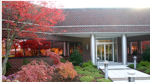
15 Third Avenue, home to TAGSYS RFID

Exa Corporation develops, markets, and supports a suite of simulation software applications for digital vehicle design along with professional engineering consulting services. Exa's customers include leaders in the global automotive and commercial vehicle industries. www.exa.com .