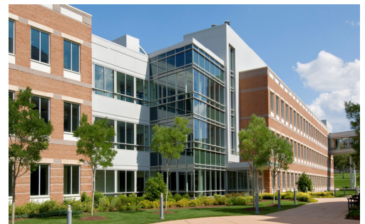
55 Network Drive, home to Exa Corporation

AdvizeX Technologies is a leading information technology provider of infrastructure and enterprise application solutions. As a value-added reseller of open-systems information technology, AdvizeX has built key partnerships with leading technology vendors Hewlett-Packard, Oracle Corporation, Microsoft, EMC Corporation, Mimosa Systems, and VMware. www.advizex.com