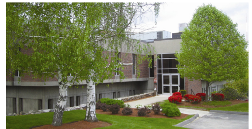
131 Middlesex Tpk, home to Dermalogica

TAGSYS RFID designs and manufactures a comprehensive RFID infrastructure for item-level tracking in a variety of industries. This universal infrastructure includes purpose-built readers and tags, as well as RFID management software, all designed to work together seamlessly in the most demanding environments. www.tagsysrfid.com .