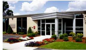
21-23 Third Avenue, home to Acronis, Inc.

industry practitioners, they provide accurate, actionable information. Their network is the strongest in the industry, including horizontal and vertical market coverage. TAC's Leadership Council provides a secure, confidential place where IT leaders can receive personal coaching by industry executives, interact and network with peers, gain insights on leadership, share best practices, and keep up to date with career trends. TAC moved into 1,776 SF of space at 15 Third Avenue.