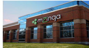
154 Middlesex Turnpike, home to Mzinga

Mzinga provides on-demand solutions that leverage the power of workplace and customer communities for growth and innovation. To do so, they provide fully hosted, Software-as-a-Service solutions. These solutions enable corporations to create social networks for their most ardent customers or alumni and retirees. It offers a menu of social modules that companies can add to their sites, including blogs, wikis, surveys, polls, calendars, forums, tag clouds, file uploading tools, individual profile pages, group pages, and idea-management tools with Digg-like voting. Mzinga recently moved into 20,317 SF at 154 Middlesex Turnpike.