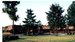
15 Third Avenue, home to The Advisory Council